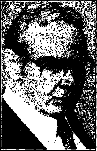
Jim Wright Talks Stir Confusion In Markets